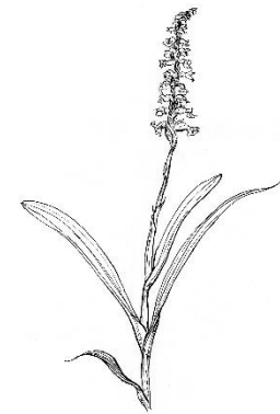
Ladies' Tresses, Spiranthes spp.

Annual Meeting Saturday , November 2, 2024, 3:00-6:00 p.m. Pine Lake Trout Club, Bainbridge. Details at a later date.